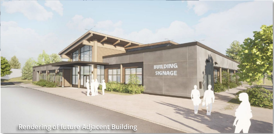
Rendering of future Adjacent Building